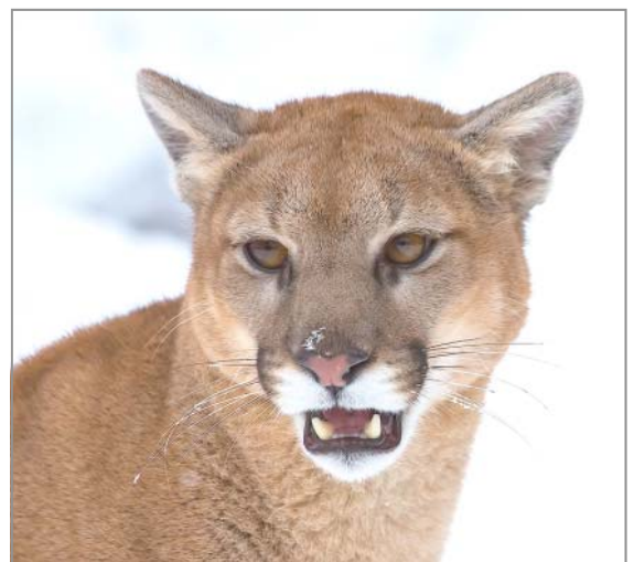
The Mountain Lion cannot roar but does make an eerie human-like scream when courting.

Mountain Lions are elusive animals. They are most active at twilight and are hard to track down so it is difficult to get an accurate count of their population. They are not a threatened or endangered animal but are a “specially protected species” in some areas.