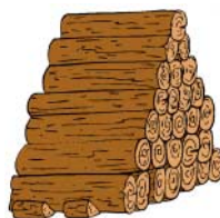
logs drilled with holes