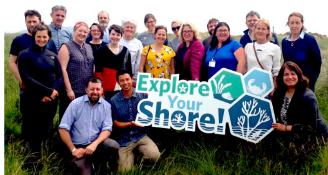
Explore Your Shore Workshop in 2019