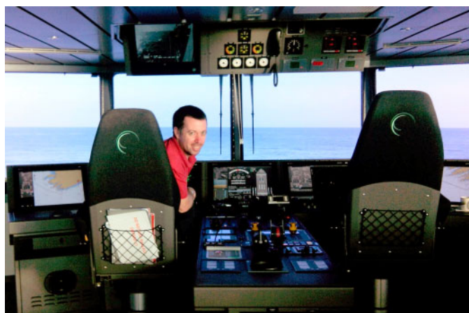
On a survey in the Celtic Sea, 2014