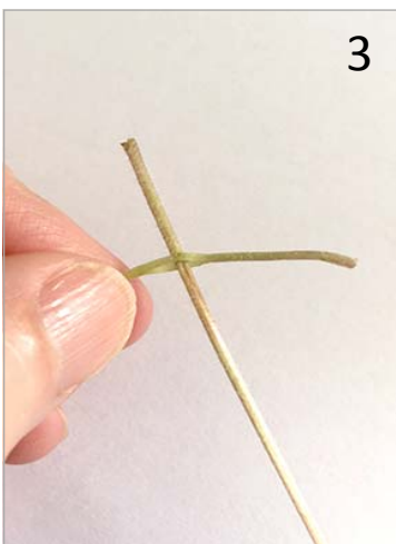
3. Thread the stem of another daisy through the hole and pull it through until the head stops.