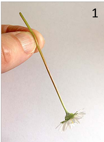
1. Near the bottom of the stem, use your thumb nail to create a split in the stem.