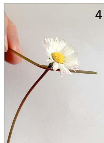
4. With every daisy you add to the chain, repeat the steps 1-3.