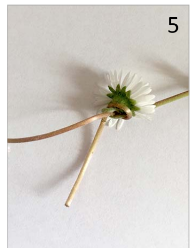
5. When your daisy chain is long enough, knot the first and last daisy to complete the necklace.