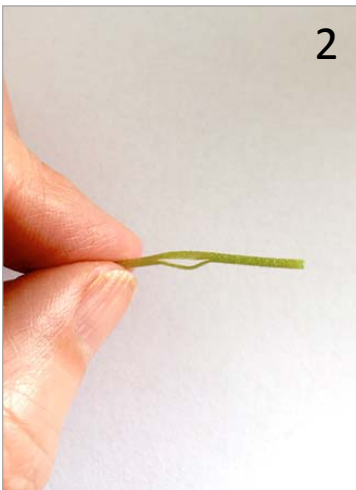
2. Push the stem from both sides to widen the split and create a hole.