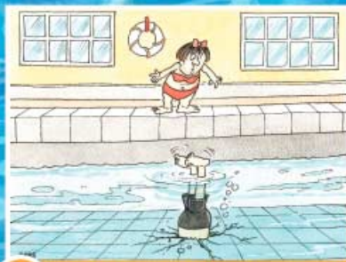
1 Be careful not to dive into shallow water.

Watch out in case there is no proper barrier between the kiddies Pool and the main Pool.