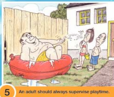
5 An adult should always supervise playtime.

Watch out for sudden drops in the Pool floor.