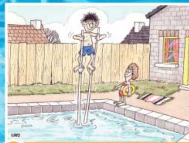
2 Check to see how deep the pool is. Ask an attendant if the depth is not clearly marked.