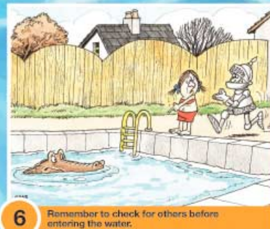
6 Remember to check for others before entering the water.

Listen to the instructions of Pool Lifeguards.