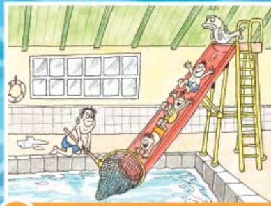
3 If you are with younger children, watch out for them at all times.

When you arrive, find out if there is a Lifeguard on duty before you go into the water.