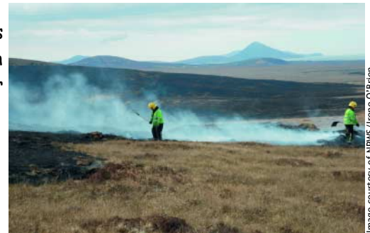
Firefighters tackling the fire in Ballycroy National Park.

The 11,000 hectare Ballycroy National Park in Co. Mayo is special because of its blanket bog (see Nature's Web - Autumn 2012). This bog started developing after the last ice age. This April, the park had three days of devastating fire that engulfed large parts of blanket bog and heath. It was the first fire there in 40 years. Around 3000 ha of the Park were burnt along with another 2000 ha outside the park. The fire was so hot that it instantly destroyed lichens, mosses and liverworts that were unique to the habitat. Other species affected include frogs, lizards, and icky invertebrates such as beetles and spiders (food for birds). Now what should be larks, pipits and other moorland birds singing, all you hear as you walk is the crunch under foot of burnt plants. Everyone must wait to see how the park will recover.