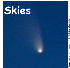
A close-up view of Comet Pan-STARRS using a telephoto lens from Sherkin Island.

One of the brightest comets seen in the night sky over Ireland was visible from March to May this year. The comet was first discovered in June 2011 by astronomers using the Pan-STARRS survey telescope, which sits on top of the Haleakala volcano in Hawaii, so they named it "Comet Pan-STARRS". Comets are usually made of rocks and ice. This comet had quite a bit of dust compared to other comets and dust reflects sunlight. As the dust was swept off it made Pan-STARRS really visible and possible to see with the naked eye. By analysing the amount of dust and gas coming from the comet, scientists were able to estimate that the comet was 1 km in diameter, a fairly typical size for a comet. But that extra dust made it look bigger.