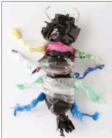
Saepes salirens (Hedgerow Hopper)

The Bloody Beach Bug is an insect at the cutting edge of the entomological world. A sharp, but nonetheless transparent type of character. He hides under the sand and if you are not careful he can destroy your sole.