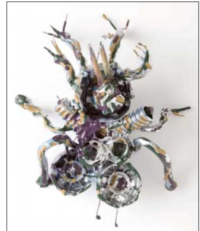
Industrius nebulo (Industrial Waster)

The Hedgerow Hopper is regrettably not yet extinct, although he finds life fairly taxing since the imposition of the levy on plastic bags.