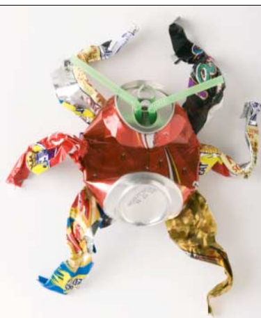
Furtiva crepido ambulans (Sneaky Sidewalker)

The Picnic Predator likes the outdoor life and is prevalent in warmer climes. If you come across him he should be told to get lost. Replace him with eco-friendly stainless steel instead.