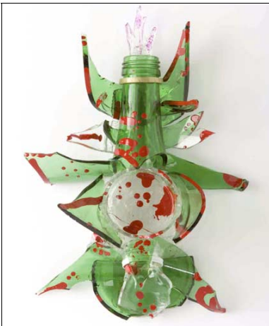
Creventus litus cimex (Bloody Beach Bug)

The Bloody Beach Bug is an insect at the cutting edge of the entomological world. A sharp, but nonetheless transparent type of character. He hides under the sand and if you are not careful he can destroy your sole.