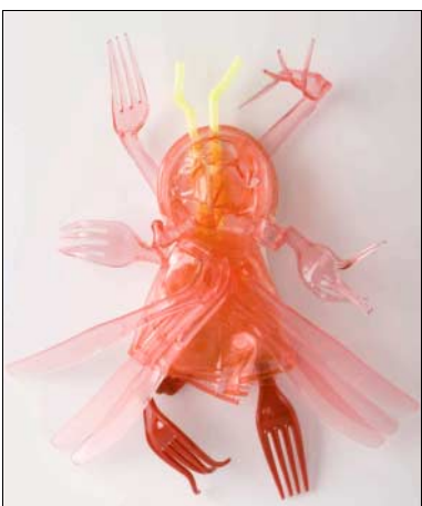
Cibus praedator (Picnic Predator)

The Industrial Waster is a toxic, oily, slick type of character. When his useful life is over we must all undertake to dispose of his remains with great care.