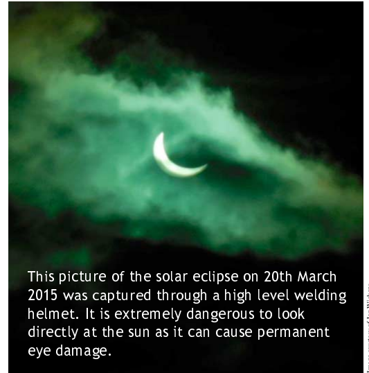
This picture of the solar eclipse on 20th March 2015 was captured through a high level welding helmet. It is extremely dangerous to look directly at the sun as it can cause permanent eye damage.

On 20th March 2015, there was an almost total solar eclipse over northern Europe. Solar eclipses occurs when the Moon passes between the Earth and the Sun. Over Ireland, approximately 92% of the Sun was obscured from our view. A total solar eclipse takes place if the Sun, Moon and Earth are lined up nearly perfectly. Though they occur every year, the last time Ireland had a good one was in 1999 and the next one won't be until 2026.