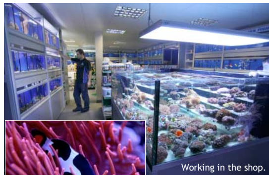
Working in the shop.

My average day is crazy, which is just the way I like it. I start work at 7.30am and finish at 10.30pm, with many late nights. Some of the things I do include managing a big team of staff and try and have everything running smoothly; working in the breeding room feeding baby seahorses and clown fish (AKA Nemo); dealing