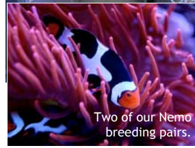
Two of our Nemo breeding pairs.