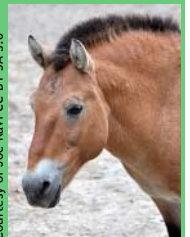
Przewalski's wild horse.