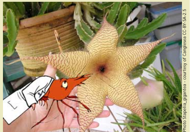
Photo Stapelia_gigantea

I hate flowers, at least I hate having to buy them. My girlfriend on the other hand loves them. Last Valentines day I had to get her a bouquet of roses. €60 they cost me. I nearly choked they were so expensive and to make it worse, all the other boy prawns were slagging me cause of my big bouquet. They're just jealous because I have a girlfriend. Next year I'm getting her something I can carry in my pocket, like a fork.