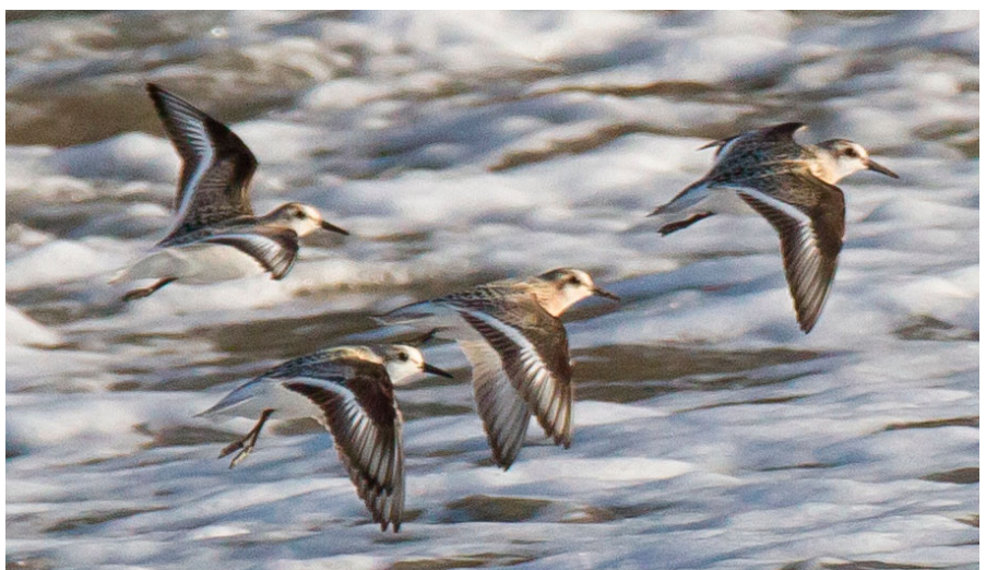
Here you can see the white wingbar on their backs.

Sanderlings are about 20 cms in length. They have black legs and bill and a white wingbar. In winter their plumage is grey on top and white underneath. In late spring and summer it becomes redder on top, with darker tones through it.