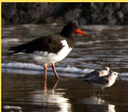
To show their size, here are two Sanderlings next to an Oystercatcher.

Sanderlings are part of a larger family of birds known as sandpipers. These are wading or shoreline birds and the family also includes such birds as the Curlew and the Snipe.