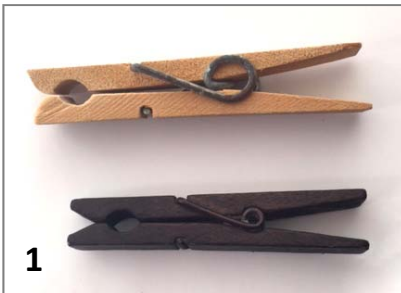
1. Colour the wooden peg with the black paint or a marker and allow to dry.