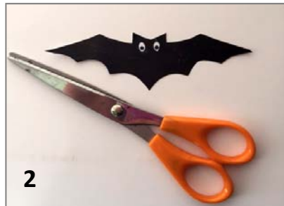
2. Print or trace the bat template above and cut out the shape. If there are any white edges, colour with a black marker.