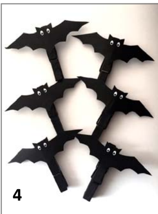
4. Attach a paper bat to the top half of each peg, using tape or glue.