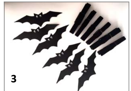
3. Colour all six pegs and cut out the six paper bats.