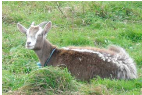
Maisy the goat enjoying a little rest!

omestic goats are small animals, similar in size to their relative the sheep. The goat has a shorter tail, which is turned upwards, horns that grow upwards (on both male and females) and the male usually has a beard.